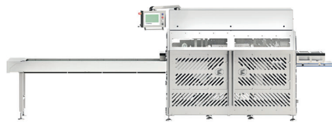
Tray Sealers Machines