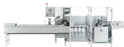
Flow Wrap Machines